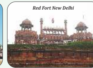
Red Fort New Delhi