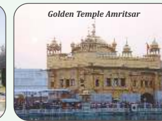
Golden Temple Amritsar